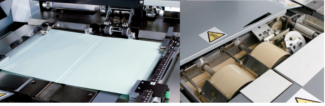
matic side gluing and Optional long delivery conveyor